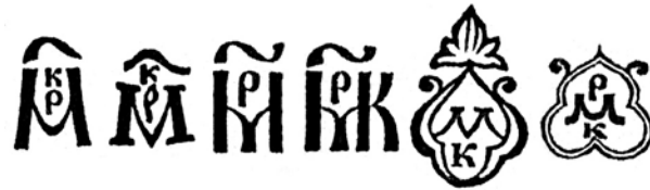
Figure 2: Examples of Mark's Chapter Symbols in the 1650 Lenten Triodion published in Moscow