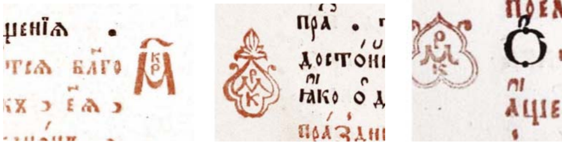
Figure 1: Mark's Chapter Symbols in the 1640 Oiko Tserkovnoye published in Moscow.