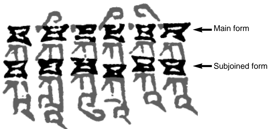
Figure 1. Samples of TIBETAN SIGN LCE TSA CAN and TIBETAN SUBJOINED SIGN LCE TSA CAN, from dPal dus kyi 'khor lo'i sgrub mchod kyi cho ga'i ngag 'don bklags chog lta bur bkod pa slob dpon mgrin rgyan zhes bya ba bzhugs , a liturgical text of Shri-Kalachakra mandala offering.

1. Of the several characters whose combining status has been changed, two of them have been definitely found in subjoined position; therefore TIBETAN SUBJOINED SIGN LCE TSA CAN and TIBETAN SUBJOINED SIGN MCHU CAN should be added to the repertoire at this time. Positions 0F8C and 0F8D are proposed.