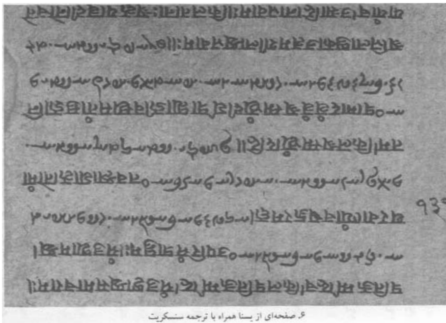
Figure 18. Passage of Avestan and Sanskrit text from Rashed Mohassel 2003. The text is interesting, because either the Avestan or the Sanskrit is inverted so that both have the same directionality. The Avestan text uses ligature 𐬀𐬀 št and ligature 𐬀𐬀 ah .