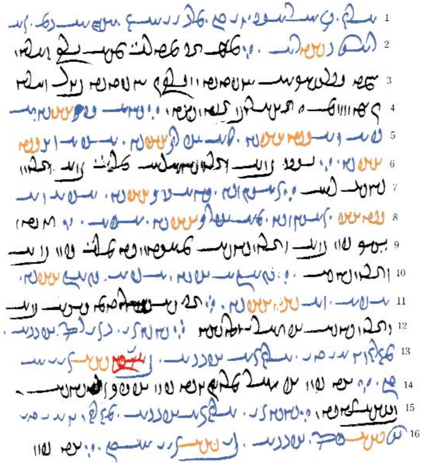
(コペンハーゲン大学図書館所蔵 K1 (330 葉表) - Vidēvdāt 21.2~3)