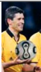
Fig. 3: Part of a picture from the title page of Deutscher Fußball-Bund, Fußball-Regeln 2006/2007 (full reference see fig. 2), showing a player holding a real soccer ball of contemporary design. This proves that the common symbol for a soccer ball (which reflects a soccer ball design commonly used in the 1970s and later), as it is used in the same official paper, does not change with the actual soccer ball design. (Nevertheless, a glyph design reflecting the contemporary soccer ball design can be considered as a valid glyph variant of the proposed SOCCER BALL symbol.)