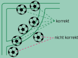
Die Zeichnung zeigt einige Beispiele von korrekter und nicht korrekter Lage des Balles.