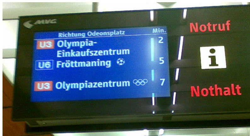
Fig. 4: a. An excerpt of the Munich underground and suburban railway map (as of 2008-03-31), showing the soccer ball symbol at the "Fröttmaning" station (where the main soccer stadium of Munich is). b. A signpost at the Munich underground station Marienplatz, showing the direction to the platform where the trains to the soccer stadium leave. c. The direction indicator at that platform, indicating that the next U6 train leaves to the soccer stadium.