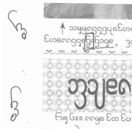
Figure 2. Example from the Xishuang Banna Daily showing SVA in print; two handwritten versions are also given.