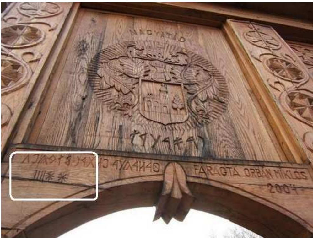
Figure 3: Rovas numerals from Nagyatád (West Hungary) (2004), Photo: János Balogh

Figure 3 presents a Szekely-gate (traditional Szekely wood carving) with Rovas inscriptions, including the \text{IIIIIX} = 2004 = 1000+1000+4