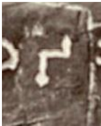
Figure 1 la

The following images in support of this glyph change come from Garrick's photographs of paper impressions of Lauriya-Ararāj pillar.