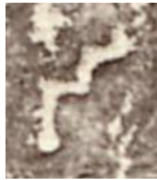
Figure 2 li